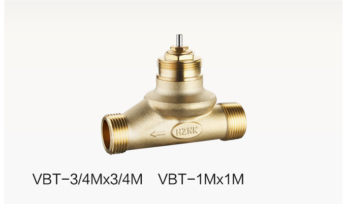
Pagoda FCU Value UMM