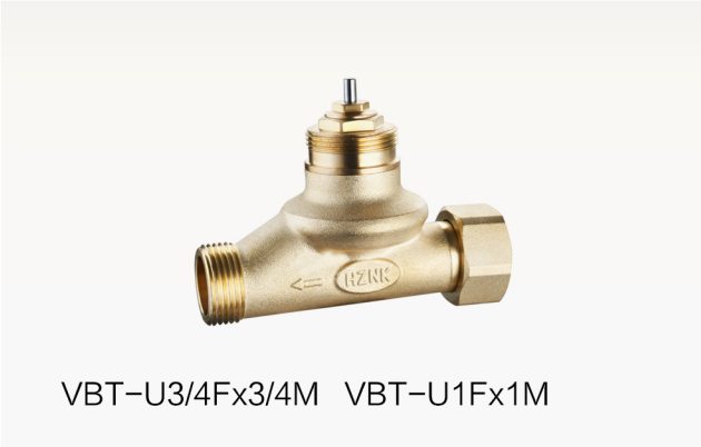
Pagoda FCU Value UFM