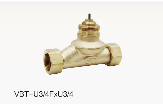
Pagoda FCU Value UFF